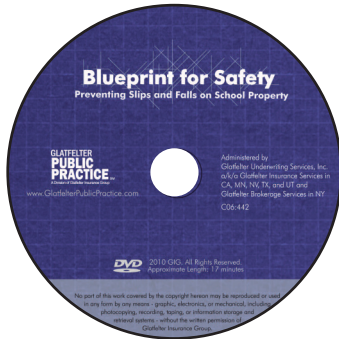
Blueprint for Safety DVD C06:442 - Educational Institutions