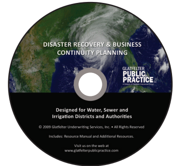
Disaster Recovery & Continuity Planning CD-Rom C06:430