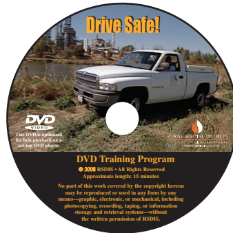
Drive Safe DVD C09:260 - Water & Sewer C06:090 - Municipalities